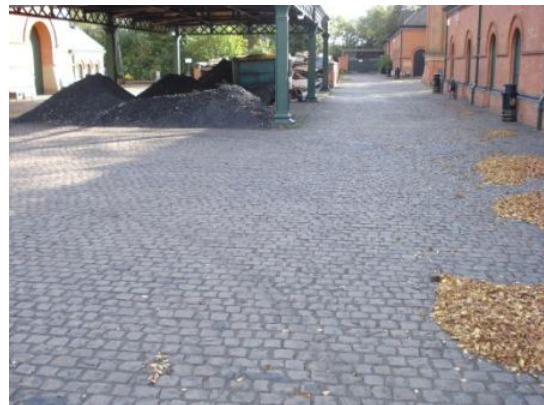
Cobbles around the Boiler House