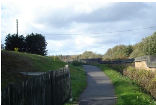
The path leading to the shop