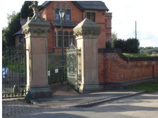
The visitor's gate