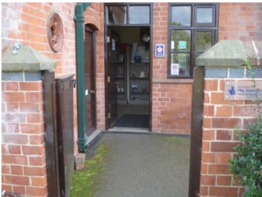
Entrance to the shop

The shop & reception is only open on steaming days unless specified otherwise. Tickets and guide books can be purchased from the Boiler or Engine House on regular static Sundays.