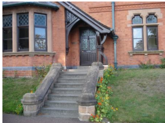
Front steps of the Superintendent's House