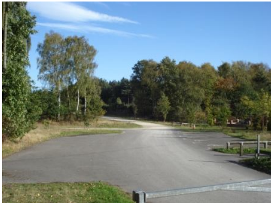
The lower car park