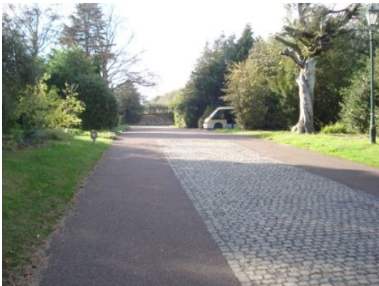
The main drive